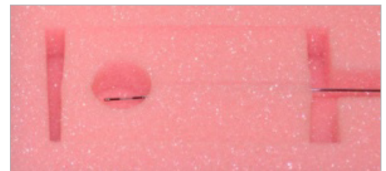
Fig. 6: Proper storage of catheter tip

Perform a final inspection of the catheter, preferably under a microscope, to ensure no contaminants remain. If contaminants are found, repeat cleaning process above. The catheter can now be stored in original packaging. Ensure that the sensing portion of the catheter is centered in the circular cut out of the foam to avoid undue stress on the membrane (Fig. 6).