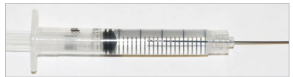
Fig. 1: Catheter in syringe with cleaner

Helpful Tip: When multiple catheterizations are being performed throughout the day, carefully wipe with wet gauze any large contamination and place catheter in Endozime® between insertions. This step prevents tissue from drying onto the catheter that can affect measurement – the length of time for this soak is less relevant. Before reinsertion, fully rinse cleaner from the catheter as described below and ensure that no contamination remains through visual inspection.