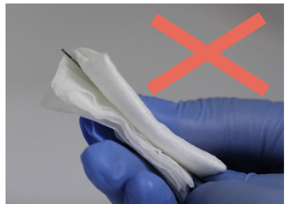
Fig. 5: Improper drying technique

Perform a final inspection of the catheter, preferably under a microscope, to ensure no contaminants remain. If contaminants are found, repeat cleaning process above. The catheter can now be stored in original packaging. Ensure that the sensing portion of the catheter is centered in the circular cut out of the foam to avoid undue stress on the membrane (Fig. 6).