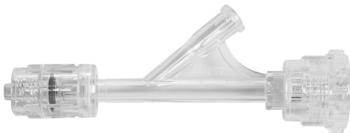
Supplied Hemostasis Valve with Cap (FA-70HV1) Cap not shown.