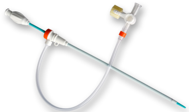
10F-12F Introducer (Recommended, not supplied)