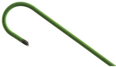
Supplied Guidewire (FA-70GW1): 0.035" X 150 cm long J tip guidewire