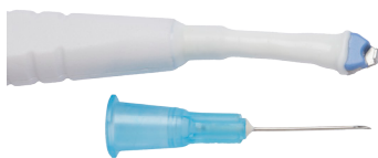
Fig. 2: Side-by-side comparison of a 0.7 mm Microvascular Flowprobe with a tip of a 25 gauge needle.