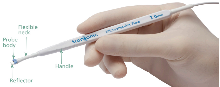
Fig. 3: 2 mm Microvascular Flowprobe showing handle and flexible probe neck for easy positioning of the Flowprobe around a vessel.