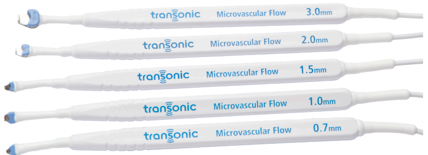
Fig. 4: Microvascular Flowprobe Series including 0.7 mm, 1 mm, 1.5 mm, 2 mm, 3 mm Flowprobes.