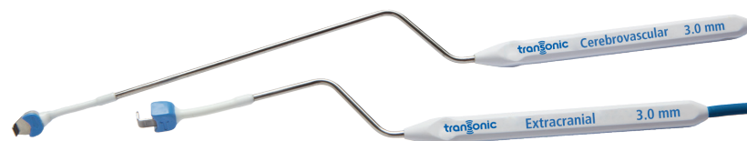
Fig. 3: Comparison of bayonet handles of the -MB-Series Charbel Micro-Flowprobes® for intracranial vessels and the -MB-S & -MR-S-Series Micro-Flowprobes for extracranial vessels during EC-IC bypass surgery.