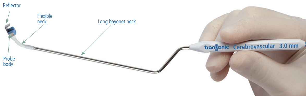
Fig. 1: The Charbel Micro-Flowprobe® is designed for deep intracranial surgery. Their long bayonet handle permits use under a surgical microscope. A flexible neck segment permits the Flowprobe neck to be bent, as needed, to optimally position the probe around a vessel.