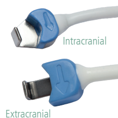
Fig. 1: Comparison of Flowprobe bodies of intracranial Flowprobes (top) and extracranial Flowprobes.

-MB-Series Flowprobes ship pre-sterilized for use where Creutzfeldt-Jakobs disease transmission is a concern. -MR-Series Flowprobes are reusable (up to 16 sterilization cycles).